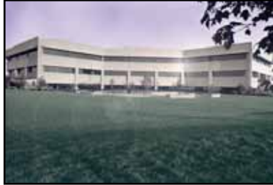
TRS Springfield office - May 1980