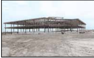
TRs Springfield office - July 1978