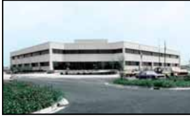
TRs Springfield office - July 1979