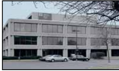
TRS Lisle office Building 1973 - present