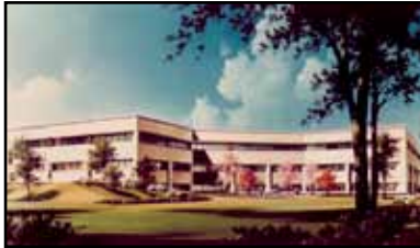
On the cover: TRS Springfield office Architect rendition

with 25 years of service became applicable only if the retirement occurred prior to July 1, 1952.