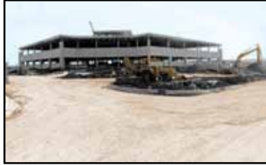
TRS Springfield office - Nov. 1978